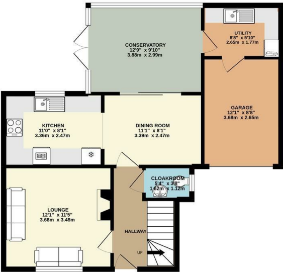
GROUND FLOOR 680 sq.ft. (63.2 sq.m.) approx.